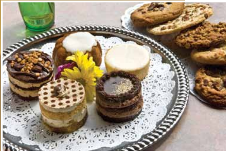
A selection of some of the gourmet fresh-baked treats featured at Crazy Alice's Café.

Written by: Sara Mullins