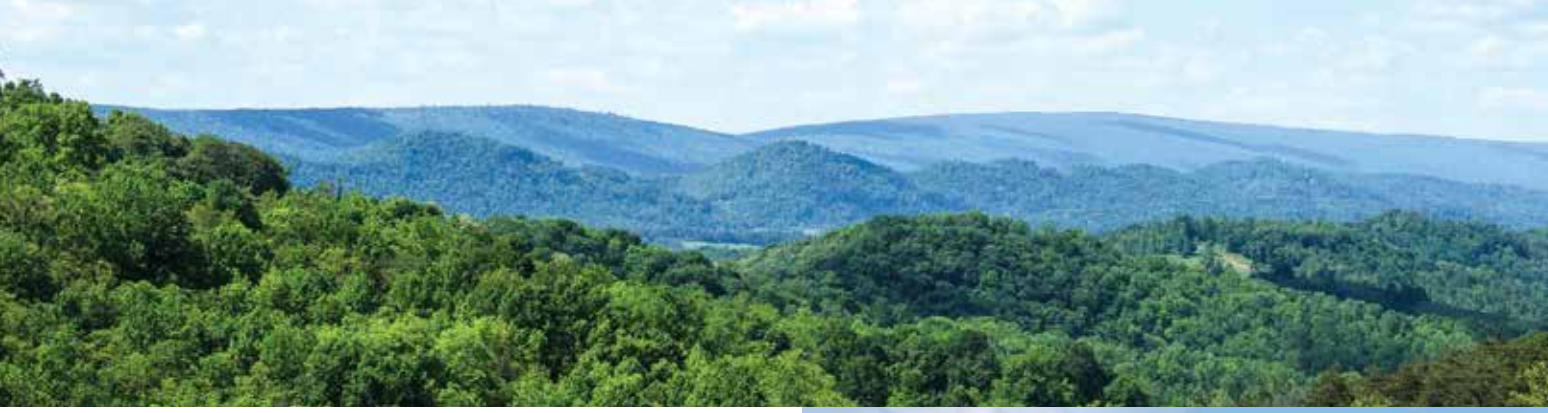
Rocky Gap State Park is nestled in the beautiful Appalachian Mountains of Western Maryland and situated on scenic Lake Habeeb just off Interstate 68, Exit 50.

a wine menu are its two most popular attractions. Located near the Golf Pro Shop is the Signatures Bar & Grill that displays a giant HD television screen and additional smaller screens for sports fans. A Sunday National Football League (NFL) package will be offered in the fall.