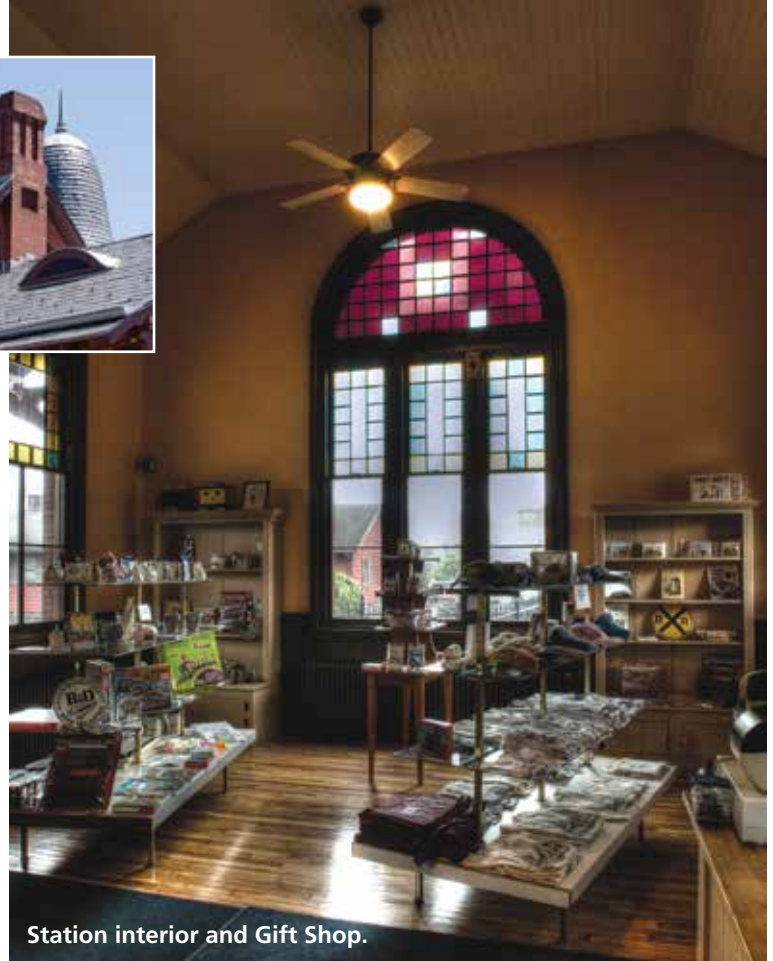
Station interior and Gift Shop.