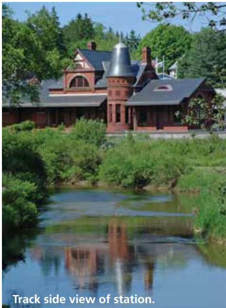
Track side view of station.

The station's transformation to the Oakland B&O Museum is complete and will make possible exhibits of local artifacts and educational programming. The railroad museum also complements the Garrett County Historical Society Museum and the Garrett County Museum of Transportation, all located in downtown Oakland.