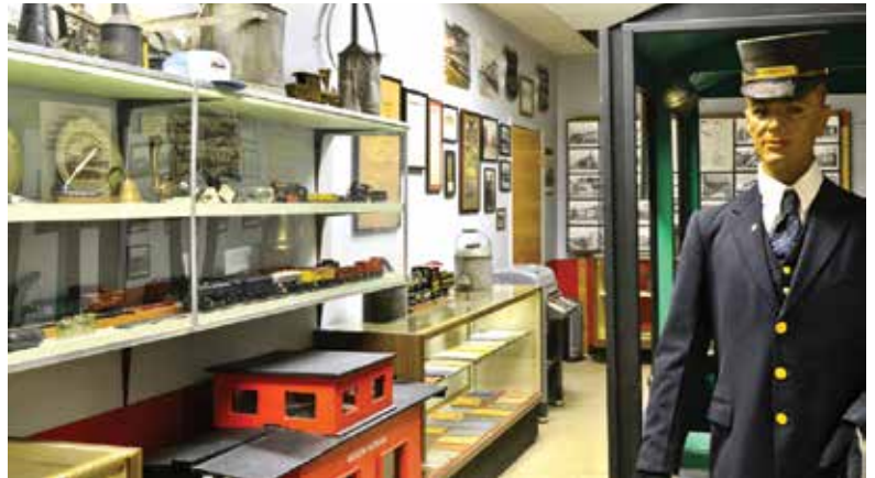
Hagerstown Round House Museum has a wealth of Western Maryland Railroad artifacts and interactive train layouts.