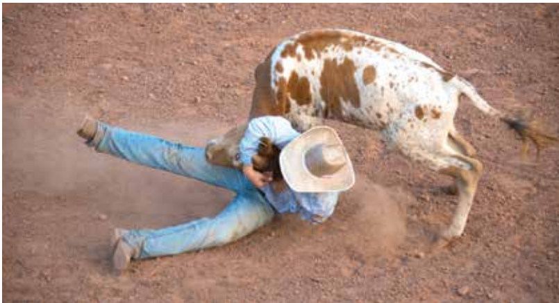
Bronco Busting (top left), Calf Roping (bottom left) and Steer Wrestling at the MDHSRA Rodeo at the Garrett County Fair.