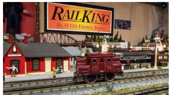
A nearly century old Lionel prewar #150 locomotive passes by the New York Central passenger station. The small electric locomotives were commonly used in New York City and proved to be popular models for Lionel Manufacturing Company who produced them for decades.