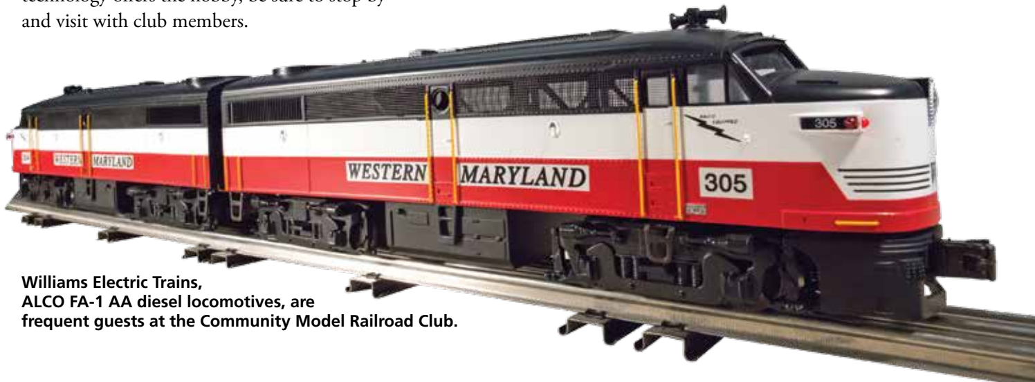
Williams Electric Trains, ALCO FA-1 AA diesel locomotives, are frequent guests at the Community Model Railroad Club.