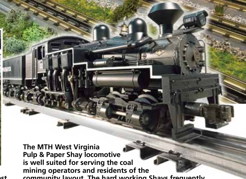
The MTH West Virginia Pulp & Paper Shay locomotive is well suited for serving the coal mining operators and residents of the community layout. The hard working Shays frequently served regional logging and coal mining businesses.

Also shown are various scenes at the Community Model Railroad Club in Frostburg, including special trains named for the area. And of course, no train layout would be complete without Mr. and Mrs. Santa Claus (facing page) and the Depot (left inset).