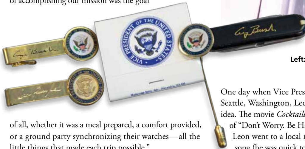
Left: Memorabilia from the Bush era.

of all, whether it was a meal prepared, a comfort provided, or a ground party synchronizing their watches—all the little things that made each trip possible."