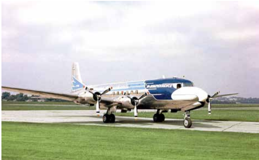
The second presidential aircraft, which served President Harry S. Truman, was known as The Independence in honor of Truman's hometown of Independence, MO.

which they serve. The “SAM Fox standard” is simply this, excellence in all and by all.