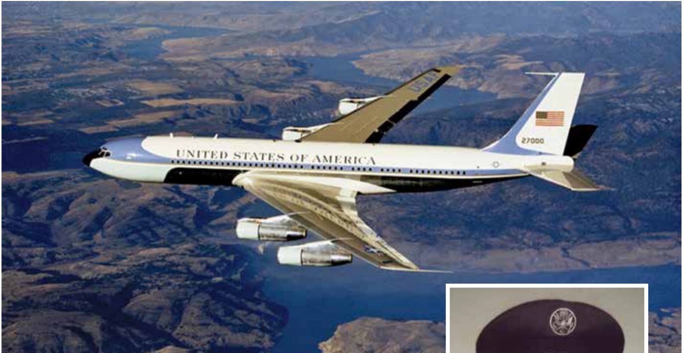
Boeing 707, VC-137C – “Air Force One” – SAM 27000