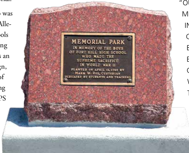
The original 1945 marble memorial sits at the base of the new memorial honoring the 38 members of Fort Hill High School who made the supreme sacrifice in World War II.