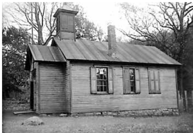
Top to bottom: Dutch Hollow School in Mount Savage is now a private residence. Slider School is privately owned and used for storage. Winchester Bridge School and Barrelville School are both no longer standing.