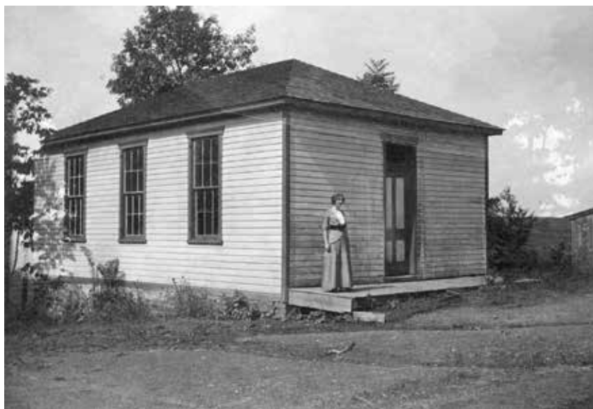
Pleasant View School was located in District Number 1, an area encompassing Little Orleans. Twenty-one students were enrolled at the school in 1903.

The Fair Ground School, located in South Cumberland, was razed to make way for Chapel Hill on Virginia Avenue, just as Chapel Hill was demolished to make way for the brick Virginia Avenue facility. Mary Hoyer School on Independence Street in Cumberland became a YMCA