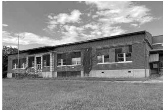
Top: The town of Luke's offices are now housed in the old Luke school.