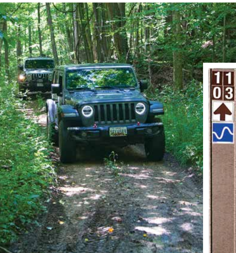
Top: Huckleberry Rocks Area has one of the spacious parking areas. The trails are well marked and color coded according to levels of difficulty — green, blue and black.