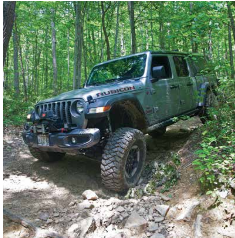
The 50 mile network of trails includes mixed forest and rugged mountainous terrain. A primitive camping area is currently available near the Park Office (no electricity or water hookups available at this time).