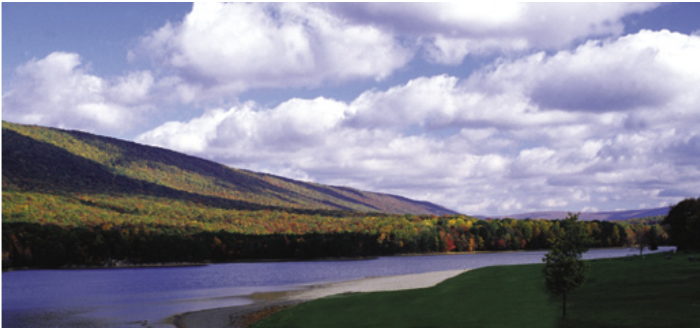
Evitt's Mountain stretches along Lake Habeeb and beyond.