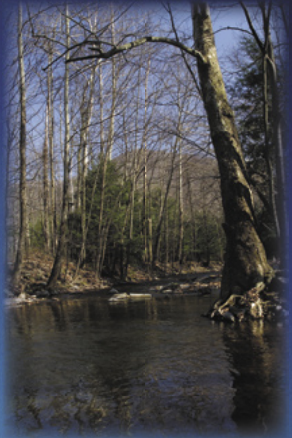
A cool, clear stream meanders its way down Meadow Mountain in Garrett County and part of New Germany State Forest.