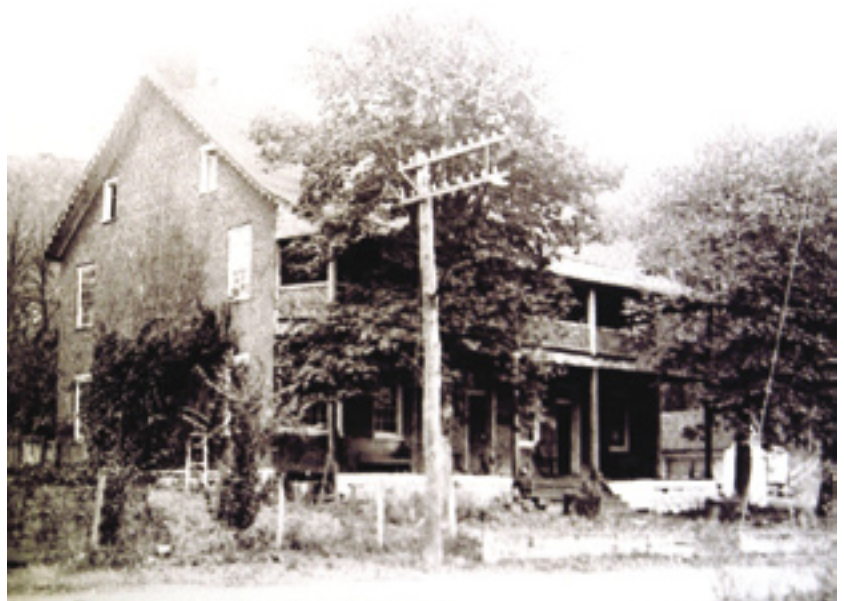
The “Six Mile House” on National Road long before it became Rocky Gap Gifts and Furnishings.

The Six Mile House appears to date from the early 1820’s because its style is typical of other inns that were