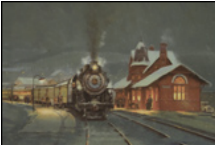
Wintertime in Oakland, Md.