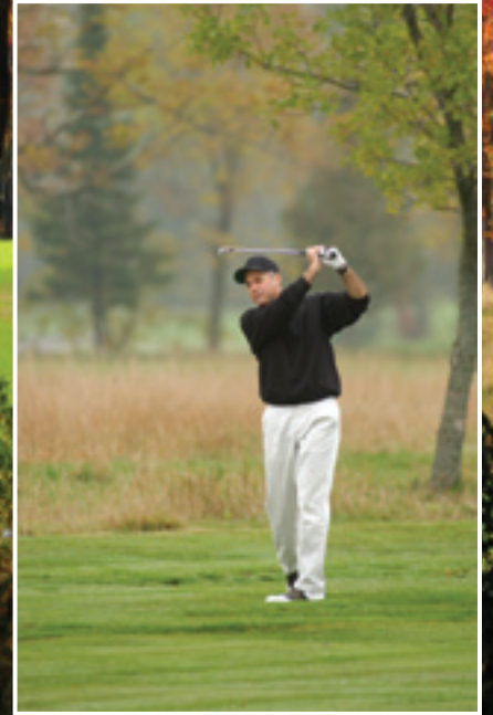
A view of Hole #3 at Thousand Acres Lakeside Golf Club.