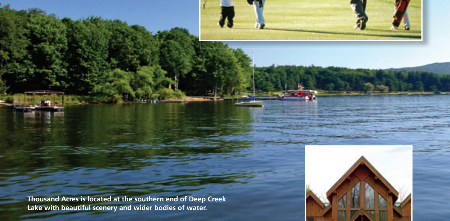
Thousand Acres is located at the southern end of Deep Creek Lake with beautiful scenery and wider bodies of water.

New this year on these southern shores of Deep Creek Lake, developers have carved out a beautiful, 600-acre parcel of land and have built the area's only golf and lakeside community. Thousand Acres Lakeside Golf Club features a Craig Schreiner designed 18-hole championship semi-private golf course with fairways nestled into the hills offering views of the lake and nearby mountain ridges. The first nine golf holes were completed in 2008 and will be open for limited play this summer. Golf cart paths meander through hardwood forests, creeks, and wetlands that have been masterfully preserved. This residential community is the only development in the area that offers beautifully wooded golf-front lots coupled with a lakefront area along Green Glade cove with swimming, fishing, and hand launching of canoes and kayaks for all members of the Home Owners Association. Craig Schreiner has designed this "golfers paradise" with championship tees, 7,000-plus yards, to forward tees for higher handicap players, to children who can take advantage of junior tees. You'll end your round with a dramatic finish on the planned 18th green which provides views of Deep