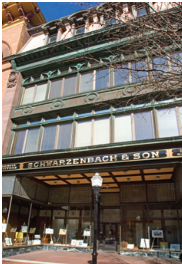
Top: Old Post Office/U.S. Courthouse building at the corner of Frederick and Liberty Streets.