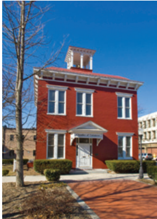
Left: The Bell Tower building at the corner of Bedford and Liberty Streets, downtown Cumberland.