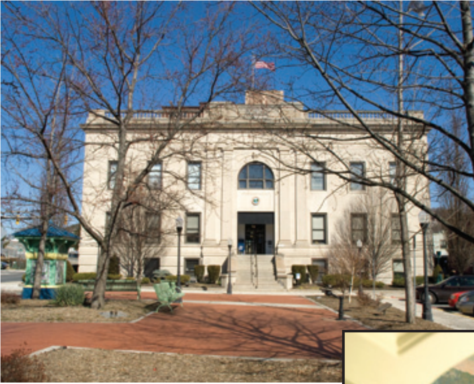
Left: City Hall building on North Centre Street between Frederick and Bedford Streets in downtown Cumberland.

Below: Interior views of the rotunda mural in the City Hall building. The 45-foot long Gertrude DuBrau mural depicts the early history of Cumberland, including George Washington welcoming General Edward Braddock to Fort Cumberland in 1755.