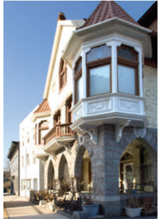
Right: The Troug House at 230 Baltimore Street.