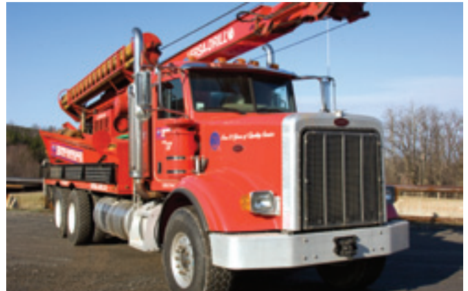
Right: Today’s equipment has come a long way from what it was eighty years ago compared to the original equipment shown on the previous page.