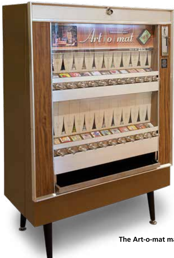
The Art-o-mat machine.