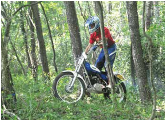
AHRMA vintage trials.