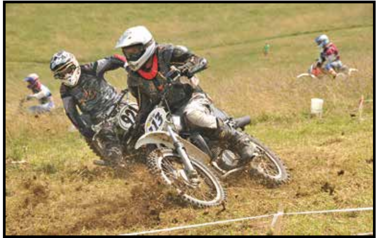
AHRMA vintage motocross.

In addition to the competitive events, organizers are planning a four day swap meet and vintage bike display. Vendors plan to sell bike parts, antiques, and other items, and classic machine owners are invited to bring their bikes