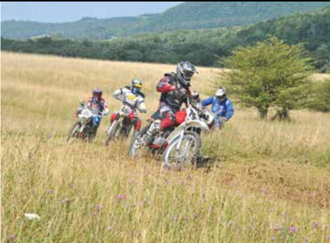
AHRMA vintage cross country.