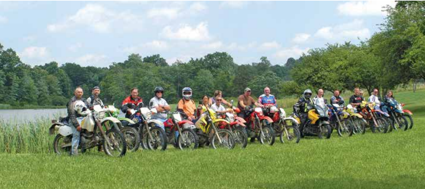
Dual sport ride.