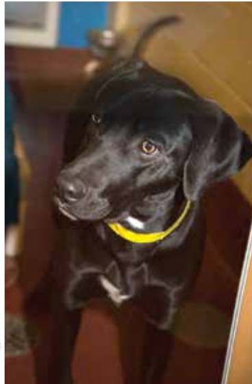
Above: It's rare to see pet hotel guest, 9 month-old Shadow, inside her deluxe den since learning how to use her doggie-door leading to her private patio.