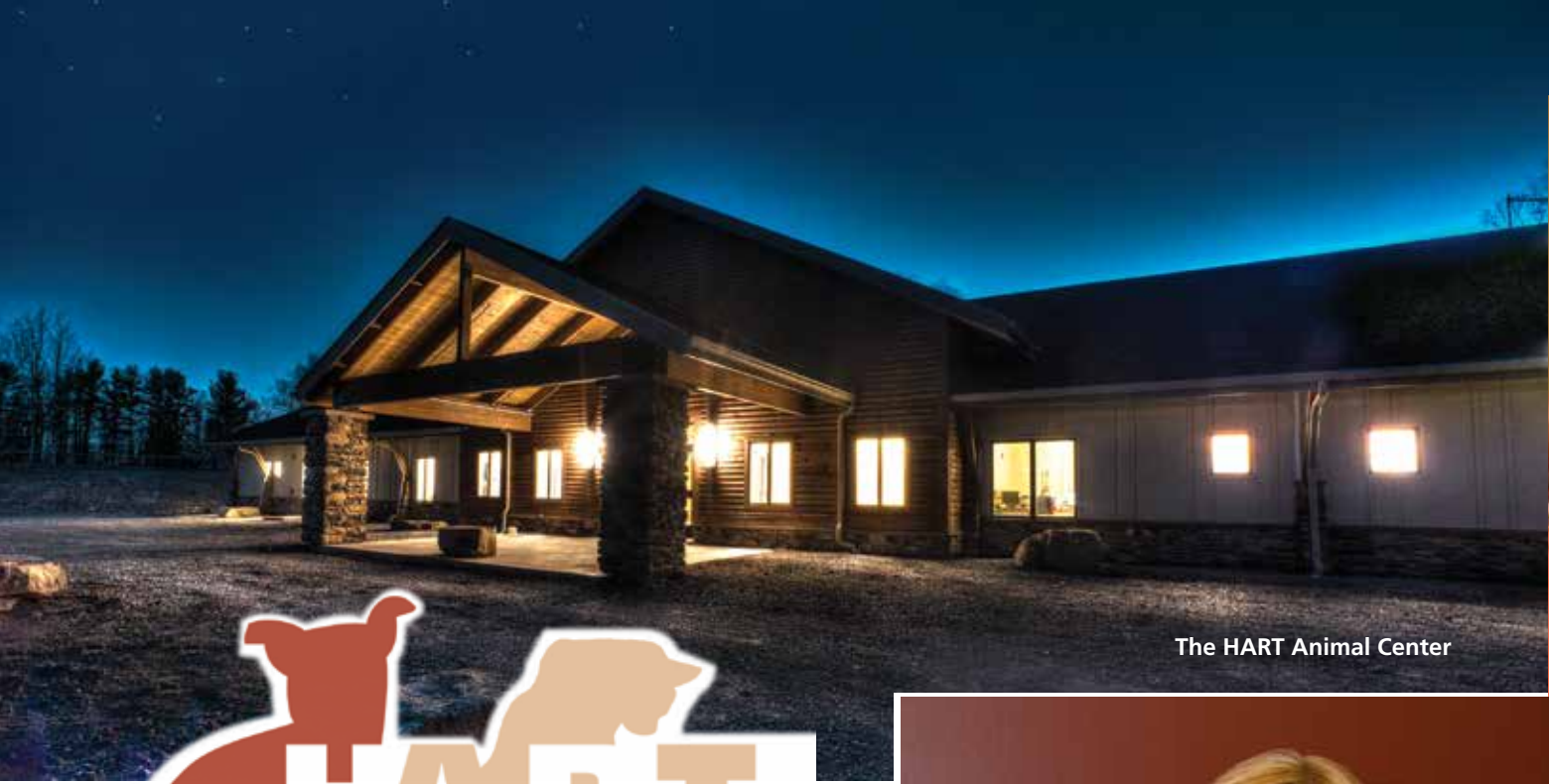
The HART Animal Center