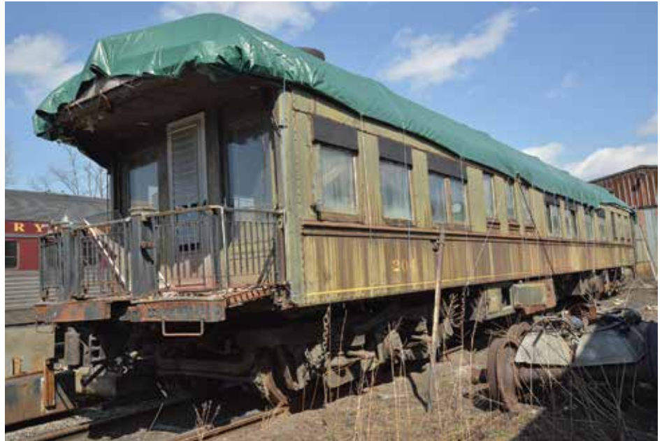
Above: The former #204 Western Maryland Railway Business Car has recently been acquired by the Western Maryland Scenic Railroad for restoration and public operations. The WMSR hopes to display this historic car during the September “Steel Wheels Festival” to be held in Cumberland.

The “Steel Wheels Festival” will also feature vendors and exhibits on the 3rd floor of the Allegany Museum located across the street from the WMSR station. A wide variety of railroading memorabilia is expected to be available for viewing and purchase.