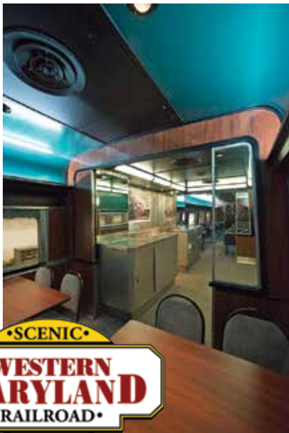
Below: Enhancements to the Western Maryland Scenic Railroad #200 car have been completed. The car has undergone a full rebuild including new electrical and mechanical work and extensive interior renovations. It was recently used by CSX officials and the Governor of Kentucky during the Kentucky Derby.