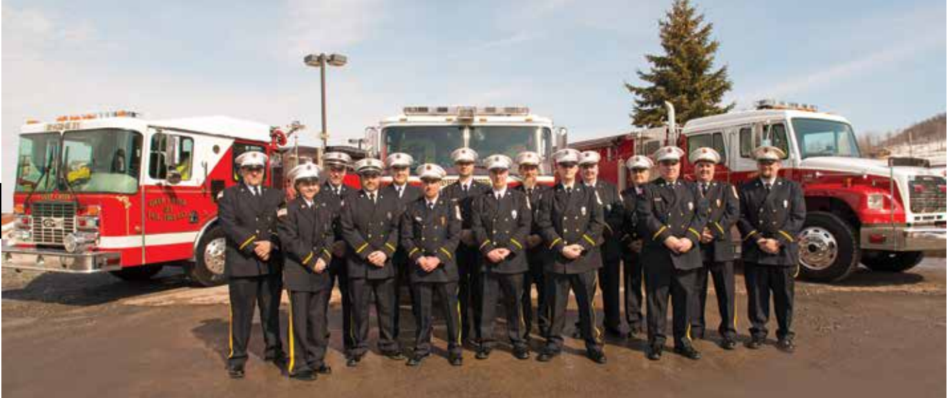
The 2014 volunteers of The Deep Creek Volunteer Fire Company.

The company has just embarked on a $900,000 project to upgrade our 48 year old facility. During this project, the company is preparing to launch a fund drive with a goal of raising $1.5 million. This goal was determined in an effort to cover the expense of the facility project and to upgrade our 20 year old first-line engine. The new facility will also accommodate a ladder truck. As structures are being erected in the lake area, it is noted that these facilities and residences are growing in height, indicating the immediate need for a ladder truck. This expense would cost the fire company approximately $750,000.