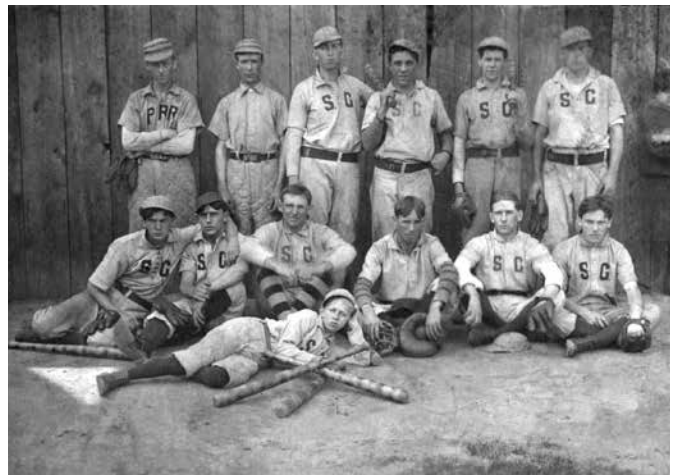
Top and facing page: Representations of the Smithsonian "Hometown Teams: How Sports Shape America" exhibits.