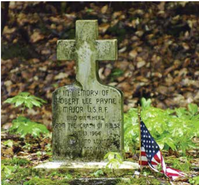
Robert Payne's memorial cross (#5 on map) located at the site where he perished; Poplar Lick ATV Trail in Savage River State Forest. These photos show before and after professional restoration.