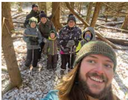
Year-round adventure tours are available for small to large groups and anywhere in between.

Swamp, and other wild areas; experiential workshops on topics such as bush craft, birds of prey, herpetology, nature photography, or team building; tours and camps for people interested in learning about small family farms and their practices; yoga sessions in Friendsville's community park or at your lodging location; and kayaking on the Savage River Reservoir.