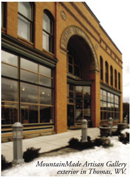
MountainMade Artisan Gallery exterior in Thomas, WV.