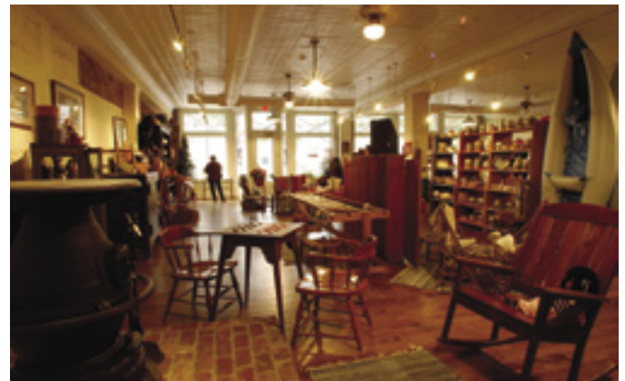
Country Store is also home of the MountainMade Candle Company. The MountainMade Candle Company produces handmade beeswax taper and pillar candles. Visitors can watch the candle-making process through a viewing window at the back of the Country Store.