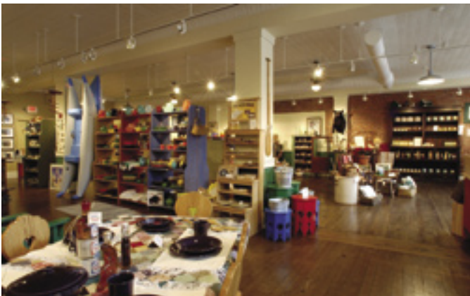
Visitors enjoy the old-time general store atmosphere of the MountainMade Country Store in downtown Thomas. Popular gift items include candles, soaps, homemade jams and jellies, honey and maple syrup. Open 10 am - 5 pm Mon. through Sat.; noon - 5 pm Sun., the